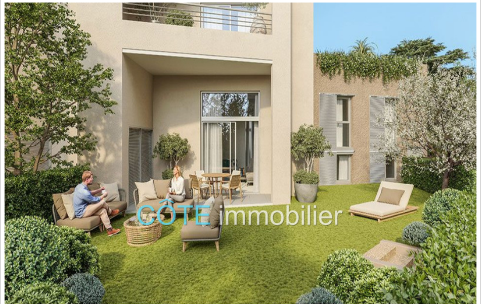
Programme neuf - Convention milancip - MLS Côte d'Azur