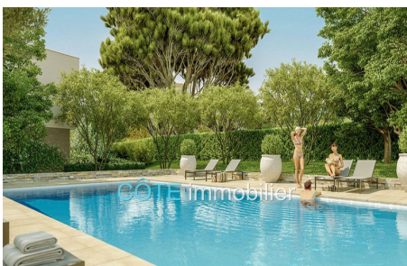
Programme neuf - Convention milancip - MLS Côte d'Azur